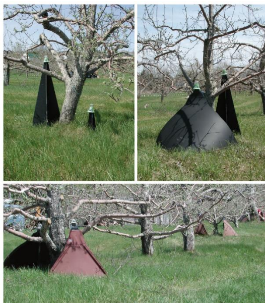
Figure 1. Plum curculio traps in an apple (cultivar ‘McIntosh’) orchard in Mont-St-Hilaire, Canada. Traps compared in this study: top left, 120 vs. 30 cm pyramidal black traps; top right, semi-conical vs. pyramidal black traps; bottom, firm vs. flexible brown fabric traps.

This experiment took place in an organic orchard in Mont-St-Hilaire, Canada, in which we compared two trap heights (120 vs. 30 cm pyramidal black traps), two trap shapes (semi-conical vs. pyramidal black traps), and two trap qualities (firm vs. flexible brown fabric traps) in a paired design (Figure 1). Other characteristics of the standard pyramidal trap (height, surface, top collection device, attachment) were maintained to allow comparisons. At the “half-inch green” stage (cultivar ‘McIntosh’), 15 pairs of unbaited traps were placed under a tree with a minimum distance of 20 m between the traps. Trees were chosen randomly from a set of trees that were similar in size. Captured insects were collected twice a week until the beginning of July. Trap positions were exchanged at each visit within each pair of treatments. The trapping season was divided into three periods: I, before bloom (17 days); II, during bloom (7 days); III, after bloom (35 days).